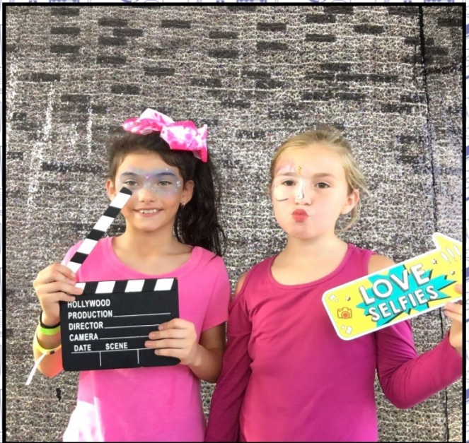
2MEE 3rd Annual Back To School Empowerment Youth Rally July 28 th 2018

"Building Future Leaders Through Mentorship, Education, and Empowerment"