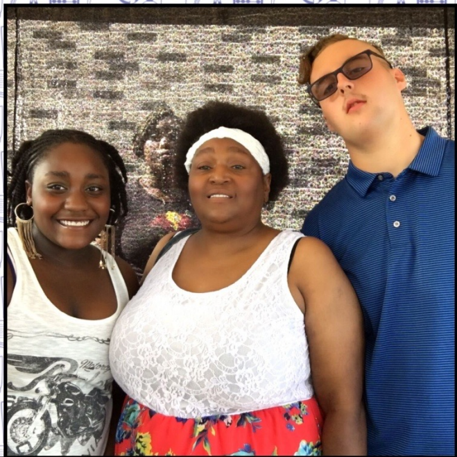
2MEE 3rd Annual Back To School Empowerment Youth Rally July 28 th 2018