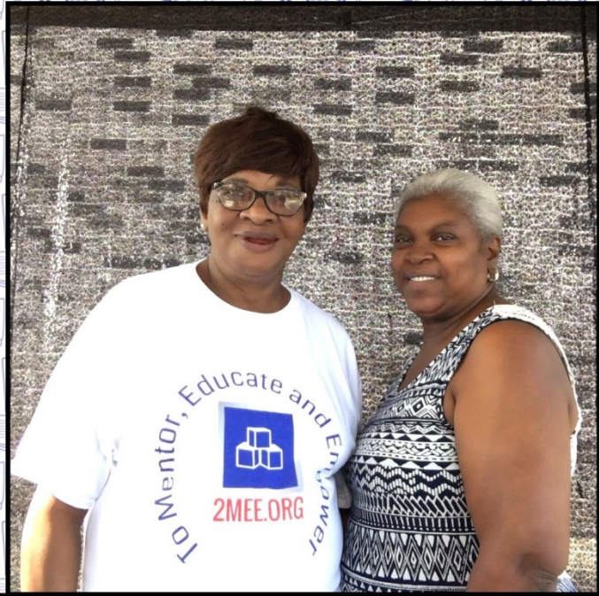
2MEE 3rd Annual Back To School Empowerment Youth Rally July 28 th 2018

"Building Future Leaders Through Mentorship, Education, and Empowerment"