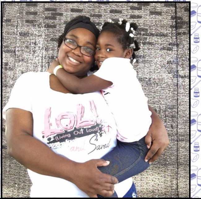
2MEE 3rd Annual Back To School Empowerment Youth Rally July 28 th 2018

"Building Future Leaders Through Mentorship, Education, and Empowerment"