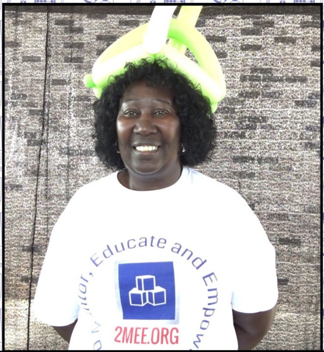
2MEE 3rd Annual Back To School Empowerment Youth Rally July 28 th 2018