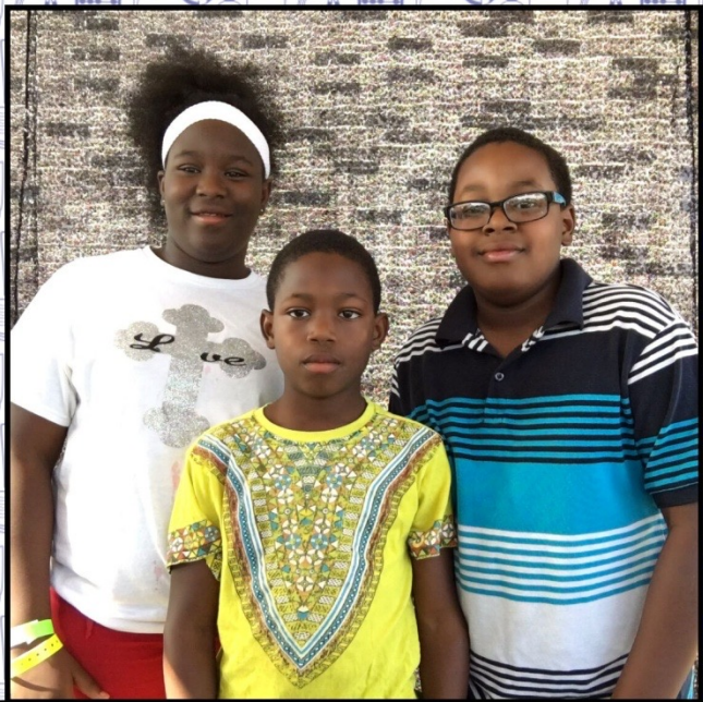
2MEE 3rd Annual Back To School Empowerment Youth Rally July 28 th 2018