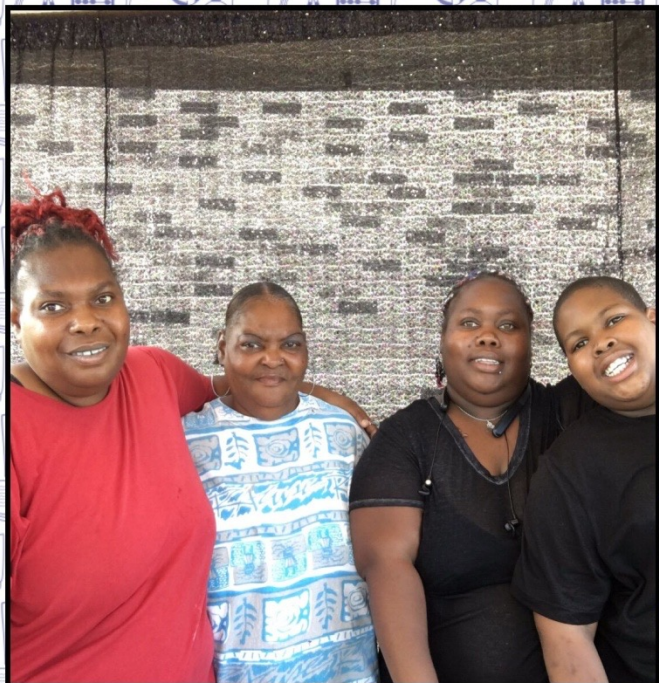
2MEE 3rd Annual Back To School Empowerment Youth Rally July 28 th 2018