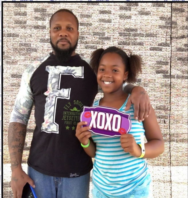
2MEE 3rd Annual Back To School Empowerment Youth Rally July 28 th 2018

"Building Future Leaders Through Mentorship, Education, and Empowerment"