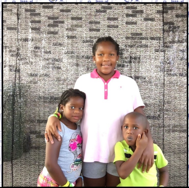
2MEE 3rd Annual Back To School Empowerment Youth Rally July 28 th 2018