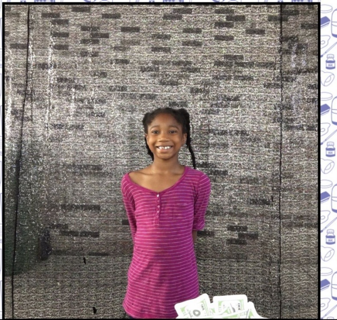
2MEE 3rd Annual Back To School Empowerment Youth Rally July 28 th 2018

"Building Future Leaders Through Mentorship, Education, and Empowerment"