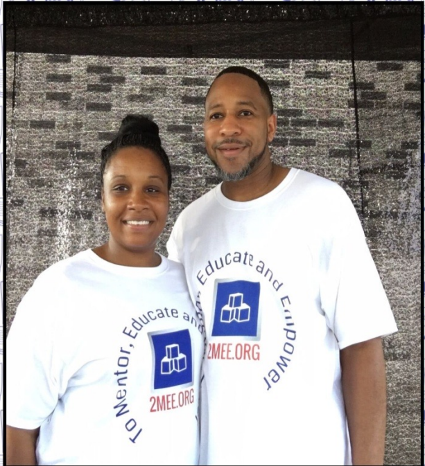
2MEE 3rd Annual Back To School Empowerment Youth Rally July 28 th 2018

"Building Future Leaders Through Mentorship, Education, and Empowerment"