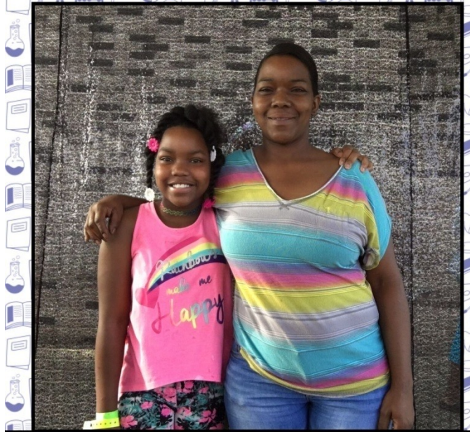
2MEE 3rd Annual Back To School Empowerment Youth Rally July 28 th 2018

"Building Future Leaders Through Mentorship, Education, and Empowerment"