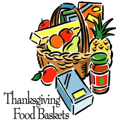
Thanksgiving Food Baskets