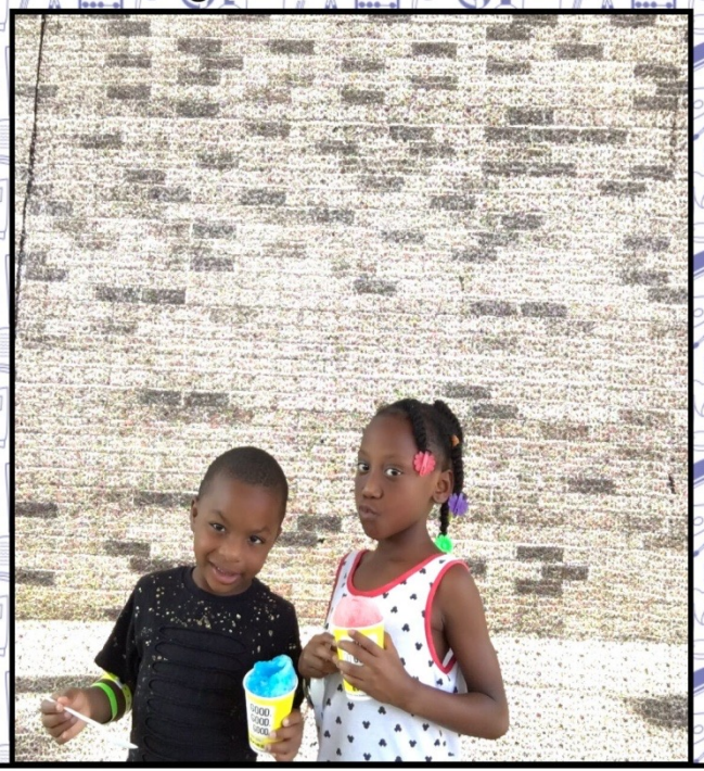
2MEE 3rd Annual Back To School Empowerment Youth Rally July 28 th 2018

"Building Future Leaders Through Mentorship, Education, and Empowerment"